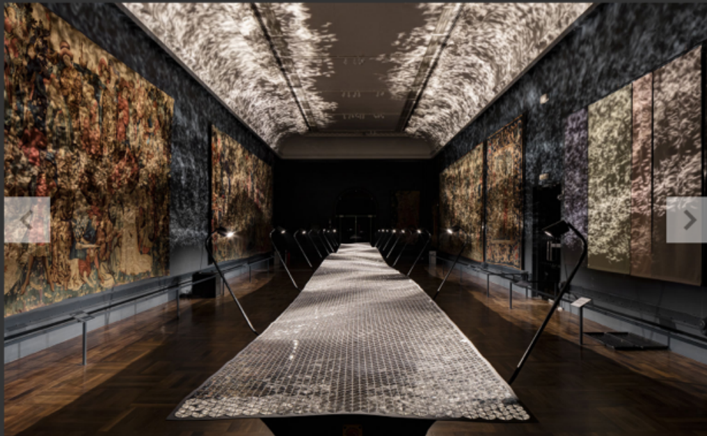
The V&A's tapestry galleries play host to the mesmerising reflections of Benjamin Hubert's Foll installation for Braun. The piece is made up of 50,000 metallic panels, each hand-stuck to create a slow-moving wave that projects onto the wall via some clever LED action by TM Lighting. Nodding to the master engineering that Braun uses for its shavers, each small blade creates its own shimmering shadow in the arched space